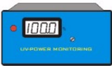
Display in separate housing