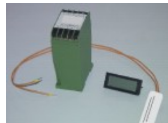
housing for rail mounting and display for mounting into front plate